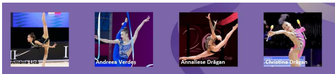
FIG Rhythmic Gymnastics Junior World Championships

The FIG Rhythmic Gymnastics Junior World Championships are a rhythmic gymnastics competition organized by the International Gymnastics Federation (FIG). The inaugural edition was held in Moscow, Russia in July 2019. Subsequent championships are then to be held biannually in odd numbered years from 2021 onwards.